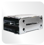
Removable Internal 3.5" holder w/ anti-vibration