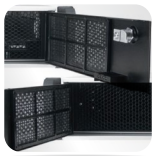
Two-door type front panel w/ filter inside for dust-proof