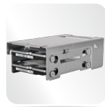
Removable Internal 2.5" holder w/ anti-vibration