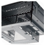
Anti-vibration drive Cages