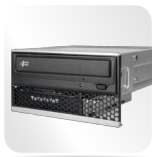
1 x 5.25" + 1 x 3.5" Removable drive bay