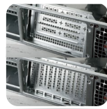
Modular rear window design (LP or FH)